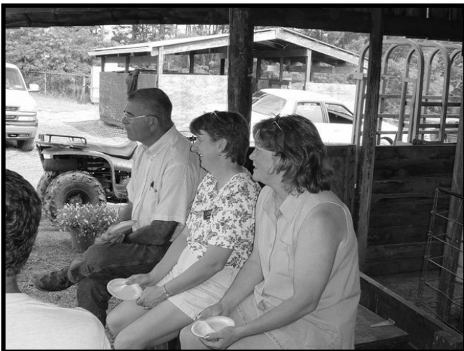
BIRTHDAY PARTY IN THE PIG BARN (GUESS WHO)